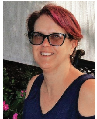
Above: CASA Robin

However, CASAs who advocate for youth with special needs face additional challenges, such as understanding complex medical diagnoses and cutting through red tape in the healthcare system. They may have a tough time communicating with or visiting their case youth.