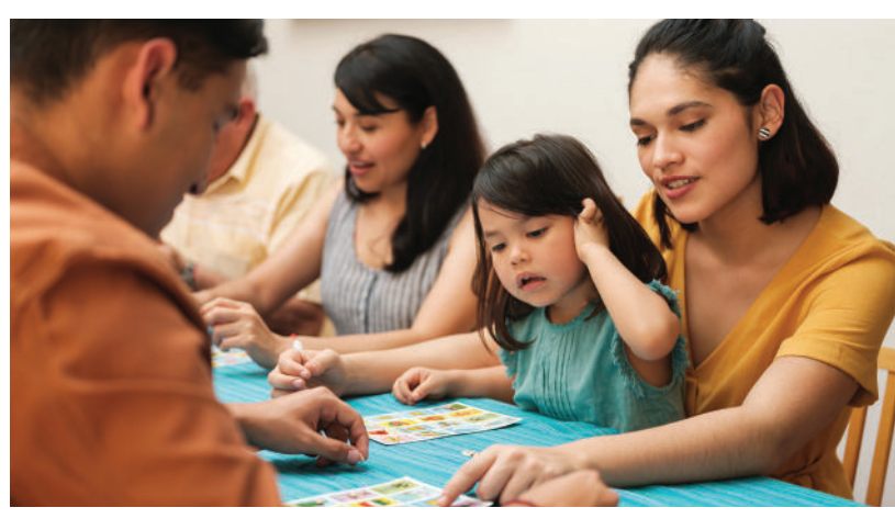
Above: A young girl plays lotería with relative caregiver.

*Names and details have been changed to protect privacy.