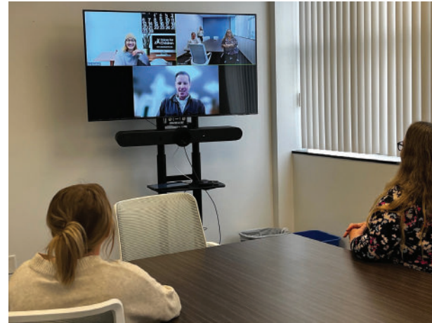
Above: Program Operations staff uses a newly installed video bar for effortless and effective virtual meetings.

LAS PATRONAS PARTNERING WITH THE SAN DIEGO COMMUNITY SINCE 1946