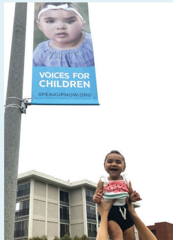
Above: VFC street banners are now throughout San Diego, including Chula Vista, La Jolla, Mission Valley, and Rancho Peñasquitos.