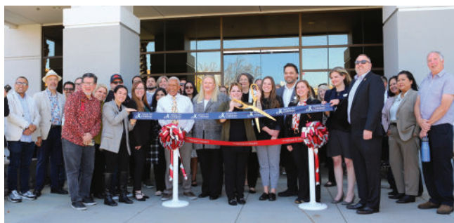
Above: VFC staff, community partners, and supporters gather for the official ribbon-cutting ceremony held on March 20.